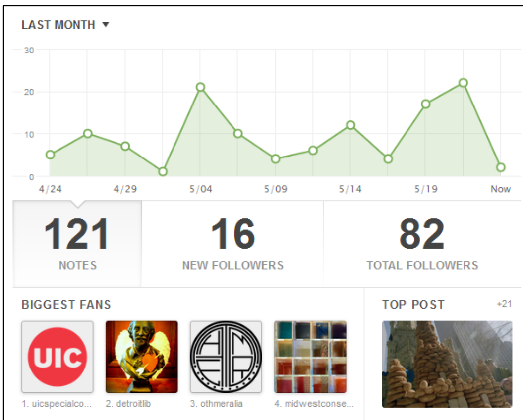
Screenshot of recent activity from the Tumblr editor's Dashboard

Creating links, creating a post in the standard format, and scheduling posts are examples of tasks that committee members may struggle with after not visiting the interface for a long time. Creating a visually appealing theme for the blog has been less of a focus for the committee, but probably needs additional work. Tumblr has an administrative interface that does not use the main blog theme, so it took some time to realize that, for example, the header image for the blog was sized too small and was not displaying effectively to potential followers on Tumblr. Right now the blog theme is very simple, though improving it would be a useful project to undertake in the future.